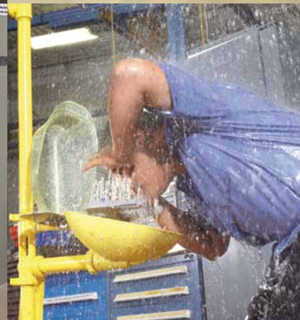
Bradley Signaling Systems are recommended for outdoor and remote locations, facilities with few employees, school science rooms, laboratories, warehouses, manufacturing facilities and more.