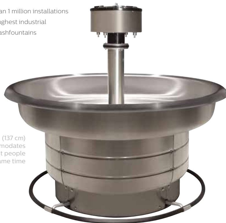
WF2708 54" (137 cm) bowl accommodates up to eight people at the same time

Bradley washfountains handle high traffic hand-washing applications by serving more users in less space, making them the perfect choice for heavy-duty applications.